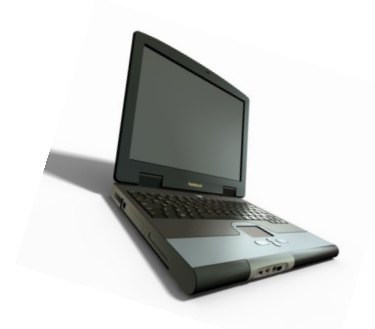
Microsoft Office, 2010

Please join us for Grab A Few Tech Tools for Your Literacy Toolbox on No-