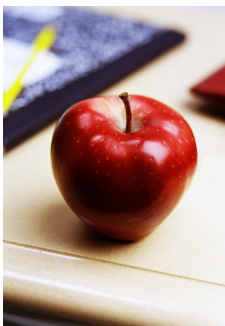
Microsoft Office, 2010

Summer flew by! September is already upon us, which is difficult to believe. The daytime temperatures are warm but the nights have cooled down, with heavy dews and a light frost on the “ridge.”