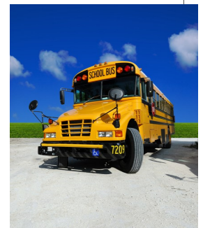
Microsoft Office, 2010

are a classroom teacher, literacy specialist, support personnel, administrator, and/or parent. All of us face challenges as we deal with further implementation of Common Core Standards, refined teacher evaluation systems, and tightening of school budgets. But we are a hardy group who have faced daunting challenges before. Here’s to a successful school year for all!